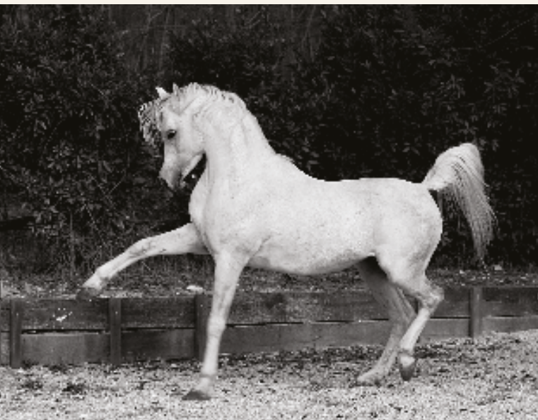
IBN EL NIL MONTASIR x NILE ALLURE