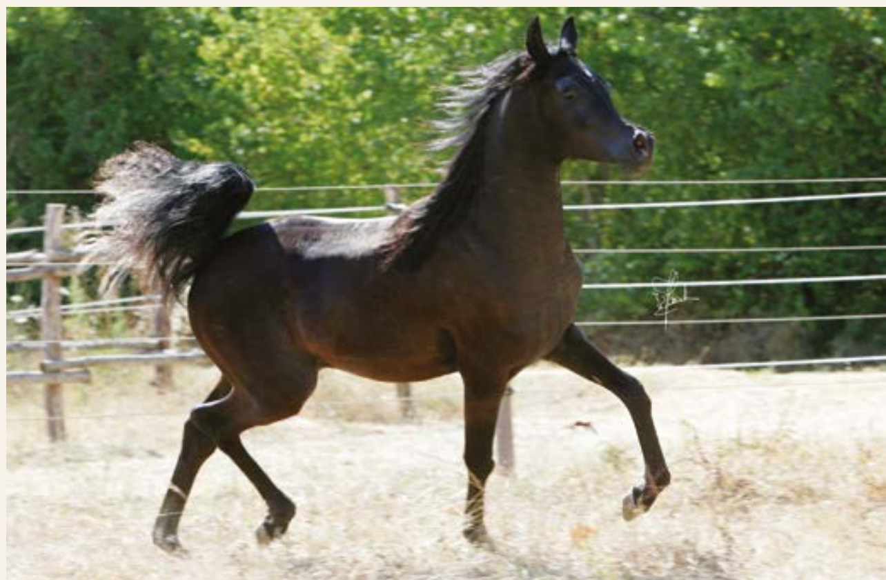
TB HAYTHAM NK MUDEER x TB HEJAZIYA