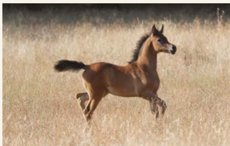
TB JAIDAA JAMIL AL RAYYAN x TB HEBA