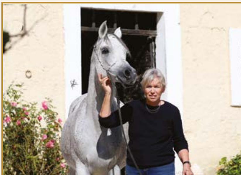
TB HEBBA NK SHARAF EL DINE x TB HASNA

An old abandoned farm was first occupied, then later leased and restored. First our riding horses stood in the sheep pens and later a group of English Thoroughbred mares were added for breeding.