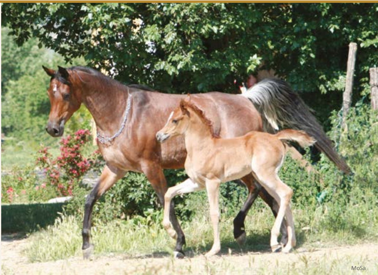
TB HASNA KEN MAHBUB x SULIFAH and TB HEJAZIYA RAMSES x TB HASNA

studbook guide how many foals Ibn El Nil had? "None so far, he seems to be sterile", was the answer.