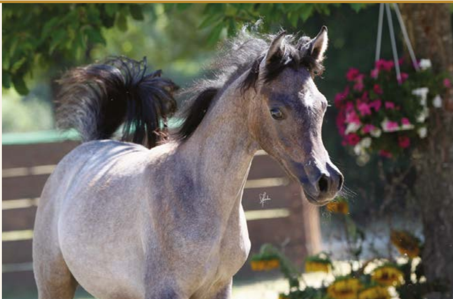
TB ALIA AL ADEED AL SHAQAB x TB HEBA