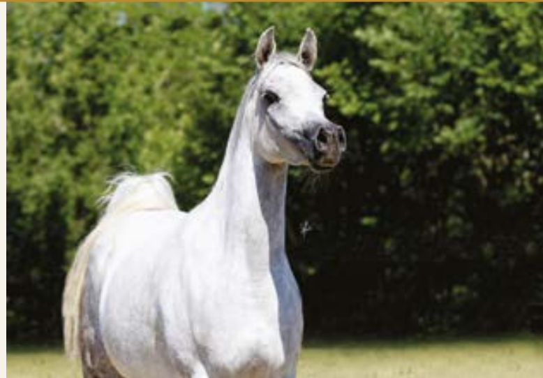
TB HELWA IBN EL NIL x TB HASNA

TB Hejaziya, a chestnut mare, is the daughter of Ramses (Adnan x Ansata