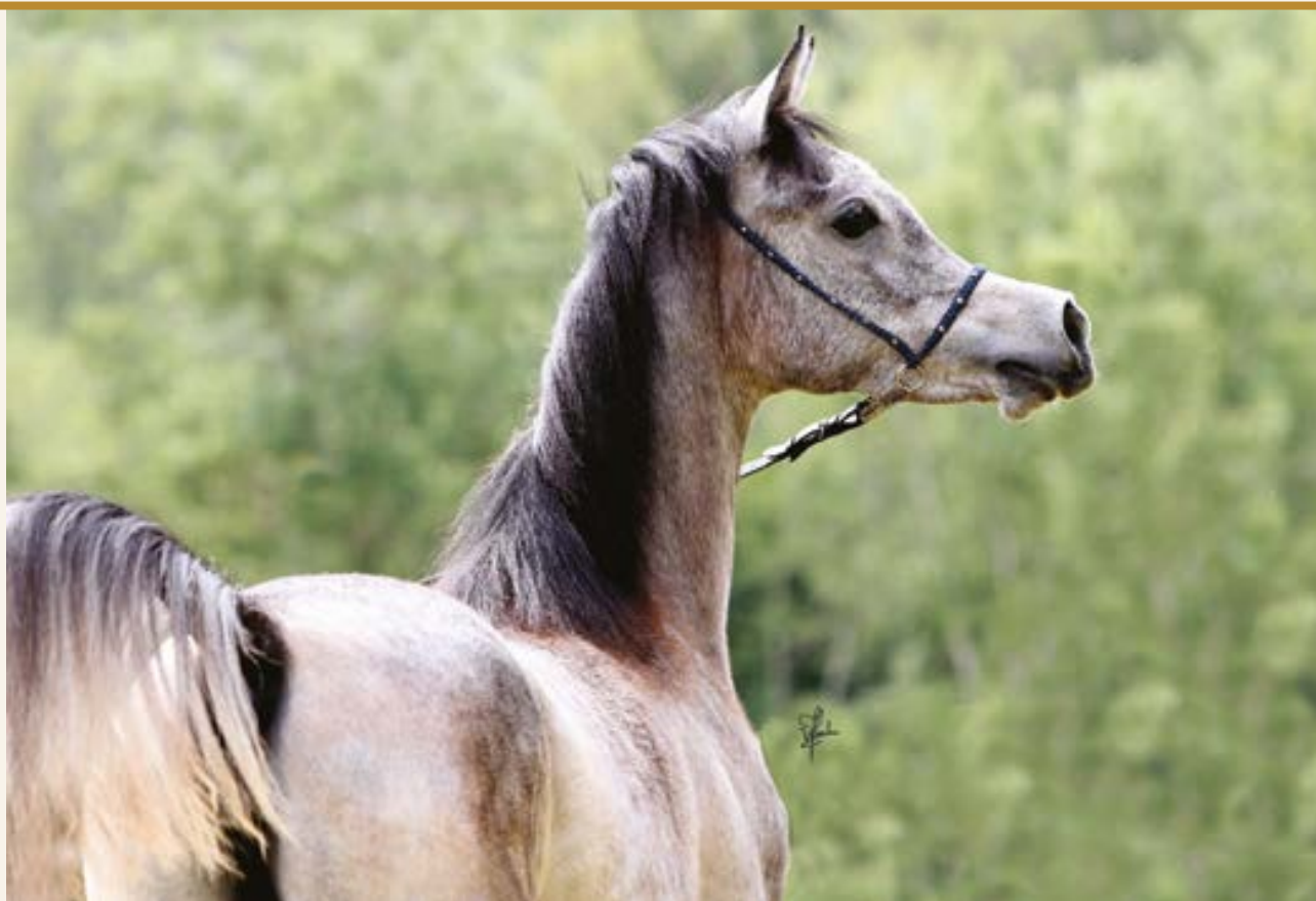
TB FAYZA JAMIL AL RAYYAN x TB HELWA