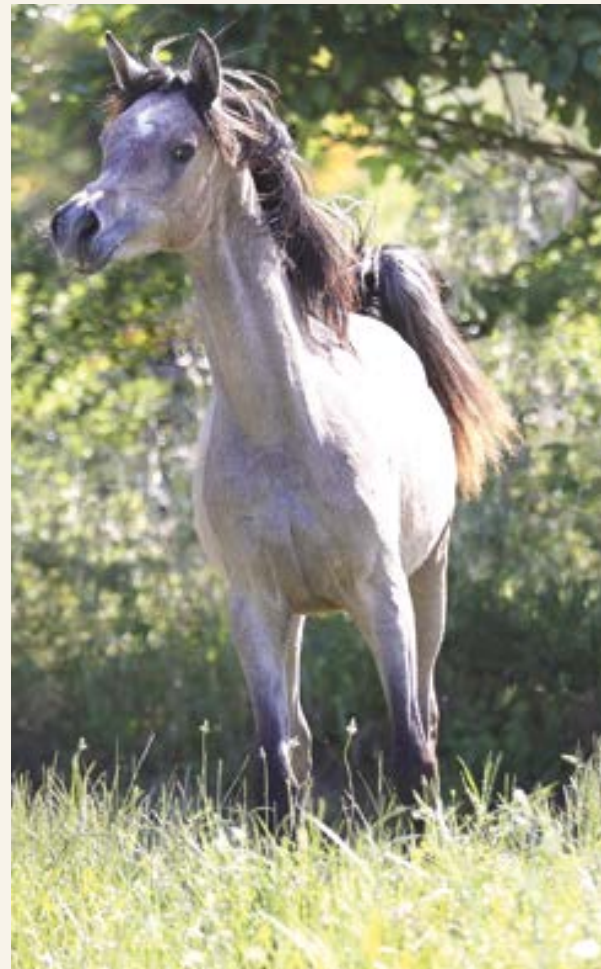
TB JAIDAA JAMIL AL RAYYAN x TB HEBA