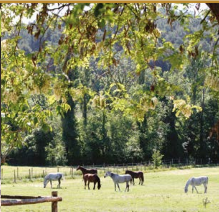
TRE BALZANE STUD