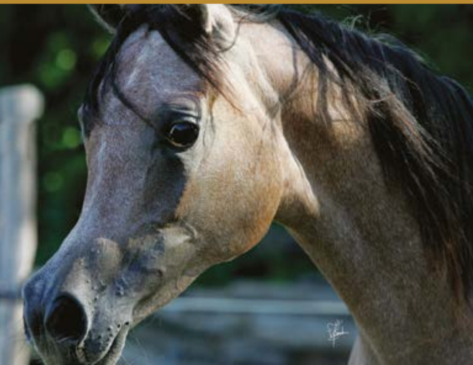
TB HEBA NK SHARAF EL DINE x TB HASNA