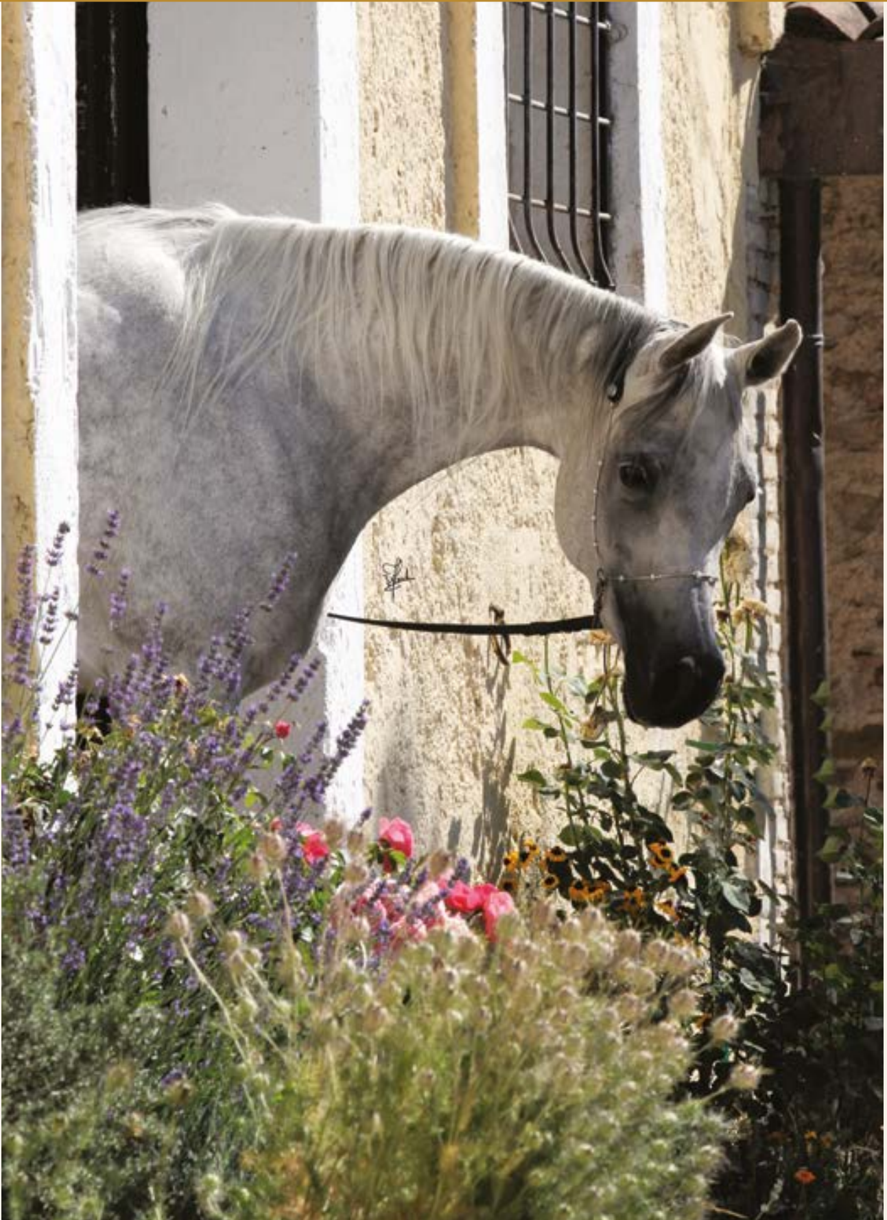
TB HELWA IBN EL NIL x TB HASNA