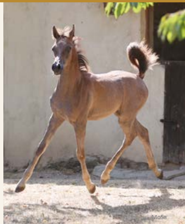
TB HAYDAR JAMIL AL RAYYAN x TB HELWA