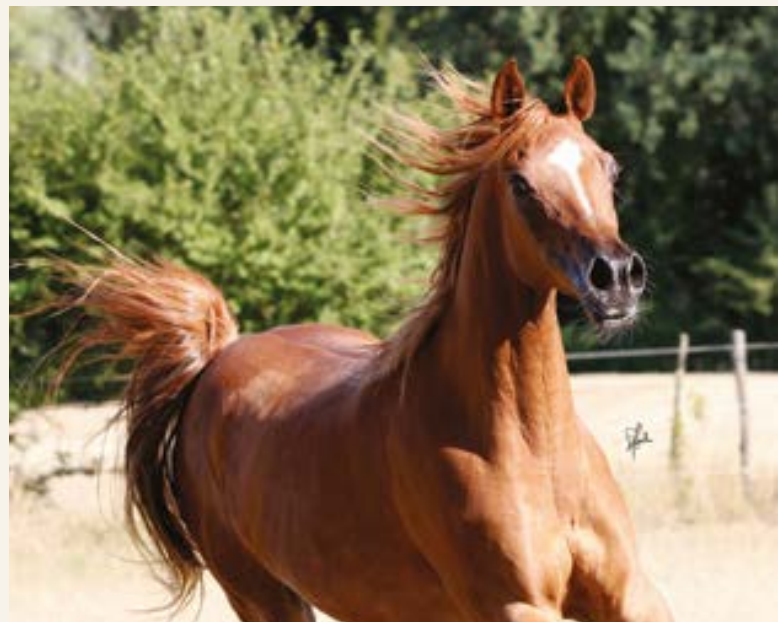
TB HEJAZIYA RAMSES x TB HASNA