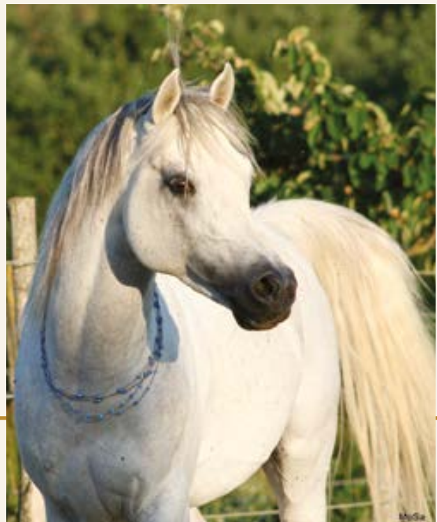
RAMSES ADNAN x ANSATA REBECCA