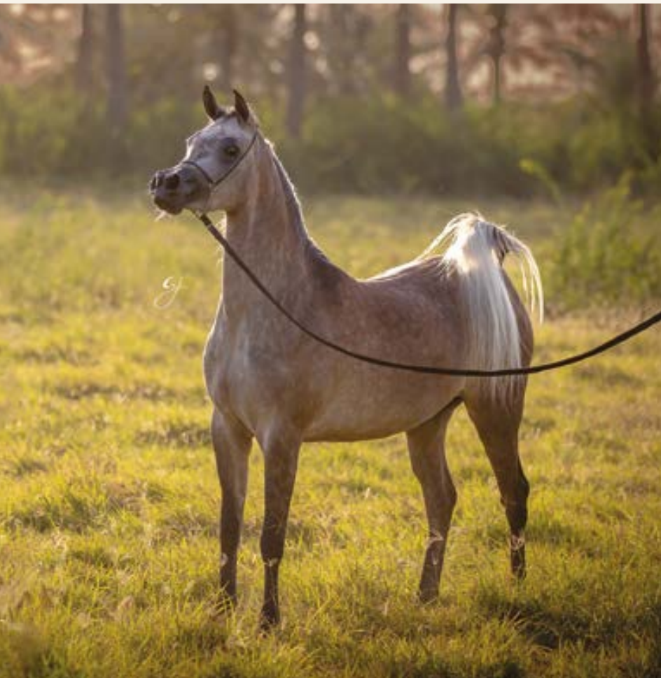
TB HAYA JAMIL AL RAYYAN x TB HELWA