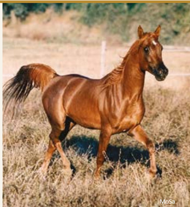
KEN MAHBUB KEN ASAM x KEN BINT BINT MAHIBA