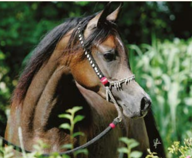
TB SABAH EL NIL IBN EL NIL x SULIFAH