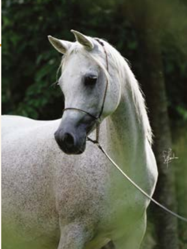
SULIFAH ALAA AL DIN x MATALA BINT MARAH BY JAMIL

I lacked the identification with the countries of origin, an advantage that Arabian breeders in the Middle East have over others. Arabian horses evoke an emotional response, even without cultural appropriation.