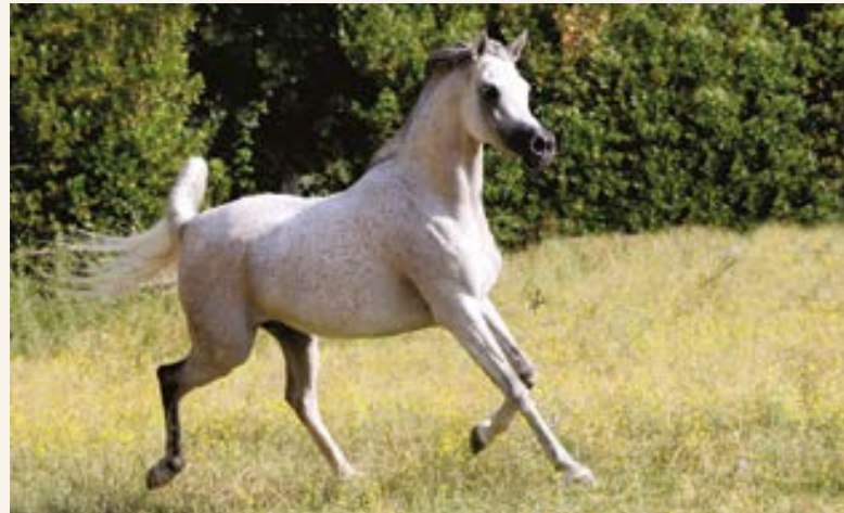
TB HEBA NK SHARAF EL DINE x TB HASNA